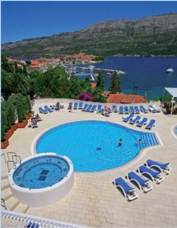
View to the sea from Marka Polo Hotel