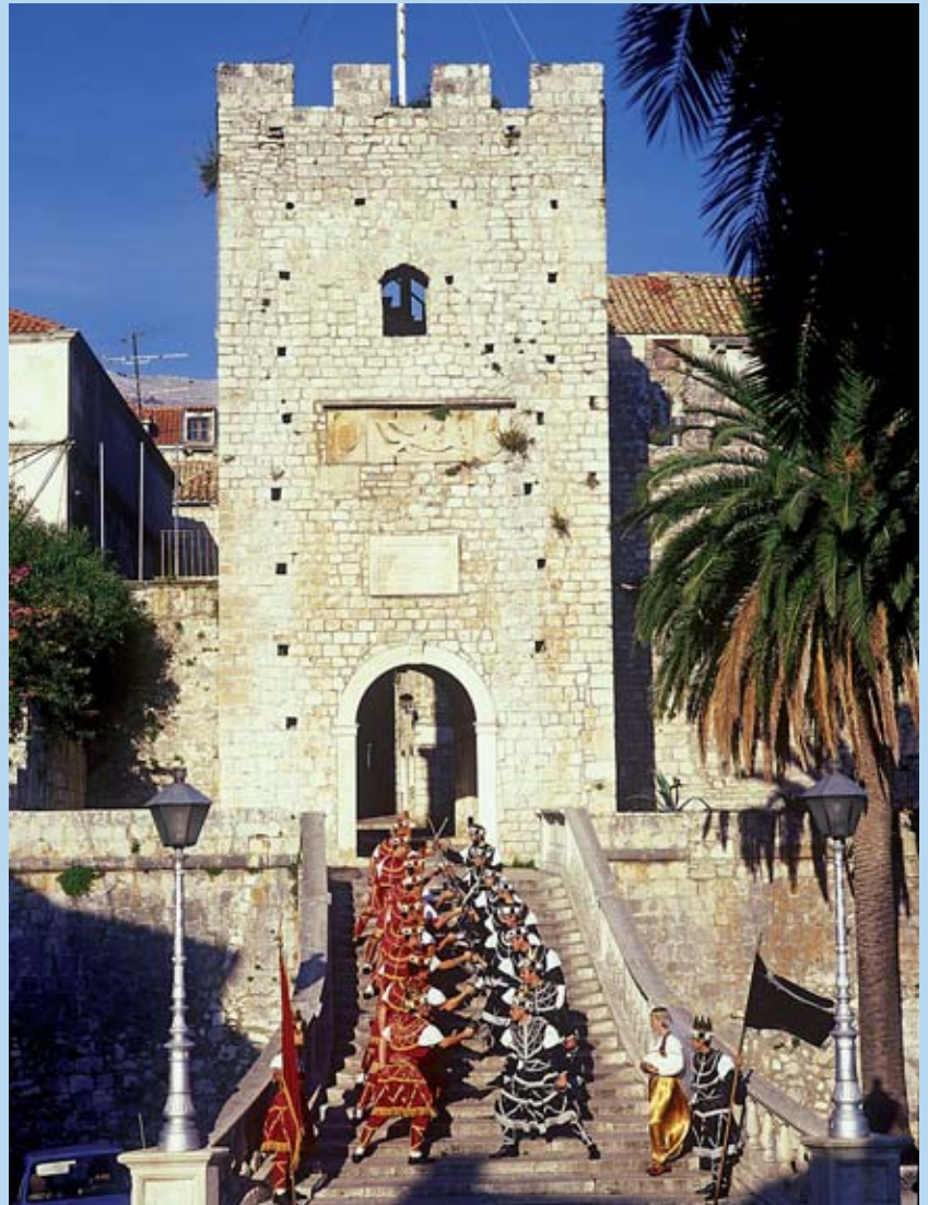
Korčula Old Town