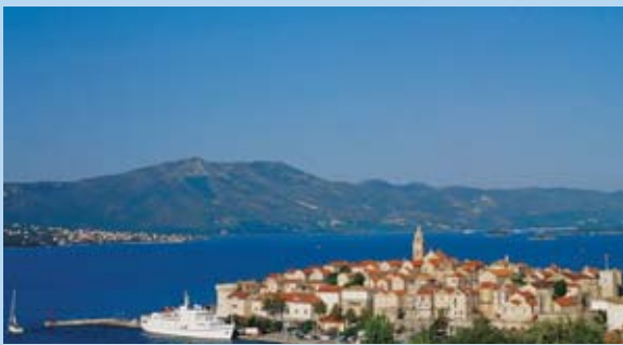
View from the Island