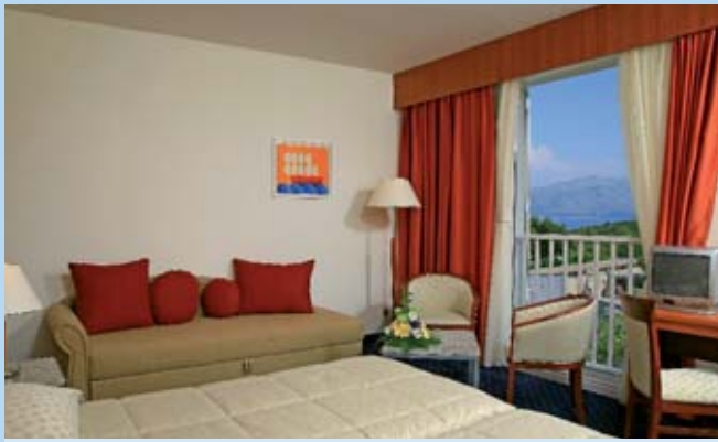
Marko Polo Hotel

Located in a quiet, elevated sea-front position just 10 minutes from the old town of Korčula and bears the name of world-famous explorer Marko Polo. This hotel has been stylishly renovated in 2007. Air-conditioned buffet and à la carte restaurant, coffee bar, outdoor and indoor swimming pool, fitness centre, beauty treatments and conference facilities.