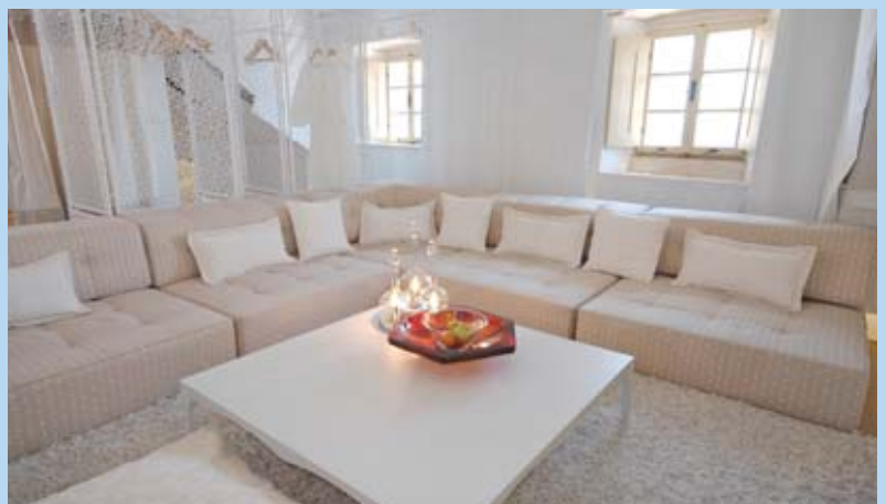
Inside the Arabian room